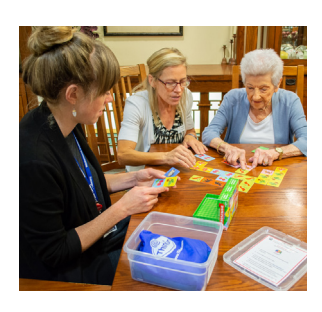
Each Active Mind Set contains two different games, promoting memory, spatial thinking and other cognitive skills. Search for Active Mind Sets in our catalogue.